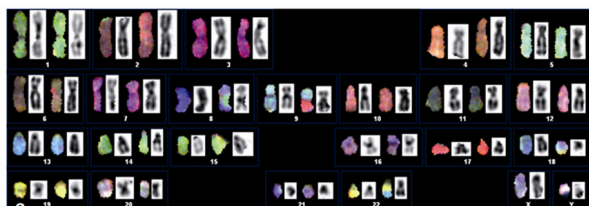
Figure 2. SKY on the lymphocyte metaphase showing the representative karyotypes illustrating the display colours on the left and the classification colours on the right. In the center, there are the DAPI band images