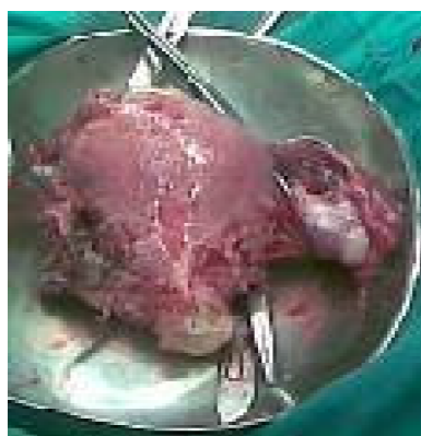
Figure 2. Enlarged uterus, ovarian metastasis, perforation of uterus, and myometrium invasion