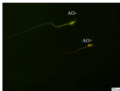
Figure 3. Spermatozoa with native double-stranded DNA (AO-) and denatured DNA (AO+); Acridine Orange staining ( \times 100 eyepiece magnification)

group III ( 9.0 \pm 2.07 ) and there was no difference between groups I and II (Figure 2). Significant differences were observed in the increase of denaturation of DNA by AO staining in group II ( 10.37 \pm 2.4 ) in comparison to group I ( 7.75 \pm 2.6 ) and III ( 7.75 \pm 1.7 ) and there was no difference between groups I and III (Table 1). The figure 3 shows one sperm with native double-stranded DNA