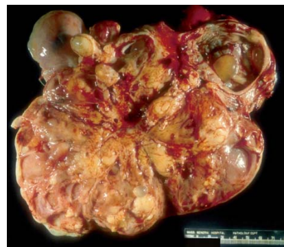
Figure 1. Gross photograph of malignant mixed germ tumor: The solid fleshy cut surface with few cysts along with areas of necrosis and haemorrhage

The median age at presentation was 15.6 years (range 8 to 20 years). Two patients were premenarcheal. All the patients were unmarried and were not sexually active. The main presenting symptoms were abdominal pain and abdominal distension in